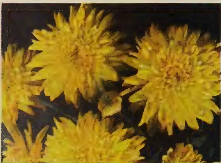
CHARLES NYE. 50c each; 3 for $1.25

6 Glorious MUMS A selection of favorites that come into glorious bloom in early October. It is true that some of the later varieties are of the highest quality. 6 Sure-to-Bloom Plants (1 of each pictured) $3.70